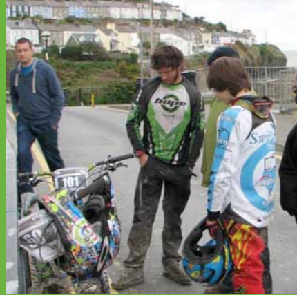
Guy Martin is a regular competitor at this event.

For further information on the event, please visit: http://mij.eydev.co.uk/