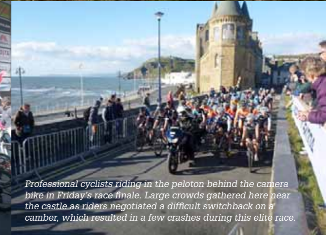
Professional cyclists riding in the peloton behind the camera bike in Friday's race finale. Large crowds gathered here near the castle as riders negotiated a difficult switchback on a camber, which resulted in a few crashes during this elite race.