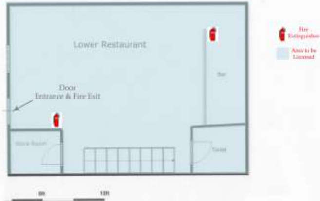
Little Italy 51 North Parade Aberystwyth