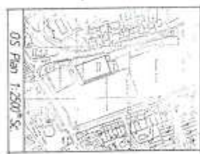
OS Plan 1/2500\"/>