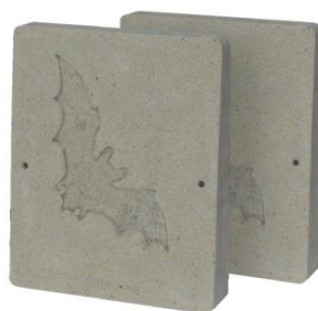
Figure 2: Schwegler bat shelter (sold in packs of 2)