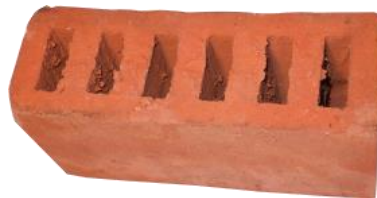
Figure 5: Norfolk bat brick