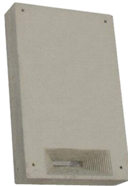
Figure 3: Schwegler 1WI