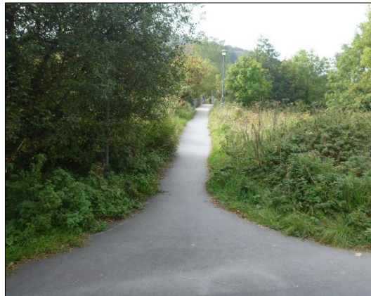
Left - pre construction