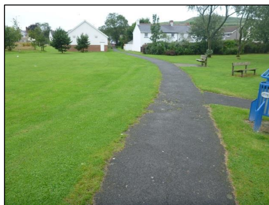
Right – pre construction